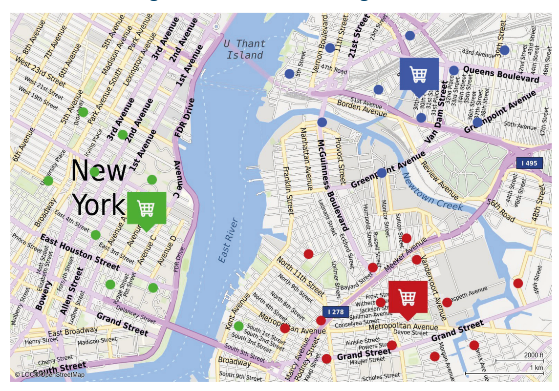
Figure 4: Destination Assignment

Driving future traffic to these locations is a shift that's underway in retail marketing. Retailers are moving away from providing goods and services as a transaction, to providing a customer experience. Among many consumers, there's a desire for a more meaningful connection that e-commerce alone cannot fulfill.