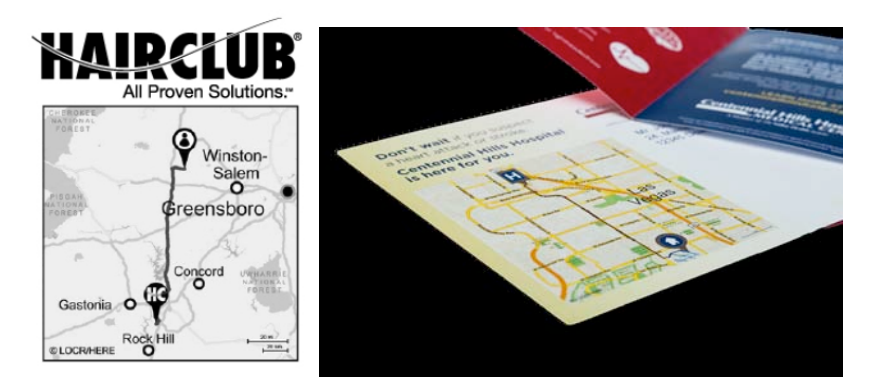
Figure 2. Maps generated for all types of marketing collateral add new revenue opportunities.

With the address list the customer supplies and a partnership with locr, you provide the location context to their communication. That might mean adding a map from one address to another, or a static map identifying a variety of potential locations. It can also mean helping them to use their mailing budget in a smarter way by weeding out target areas that may not yield the best results. Working with locr opens the door to more than just maps.