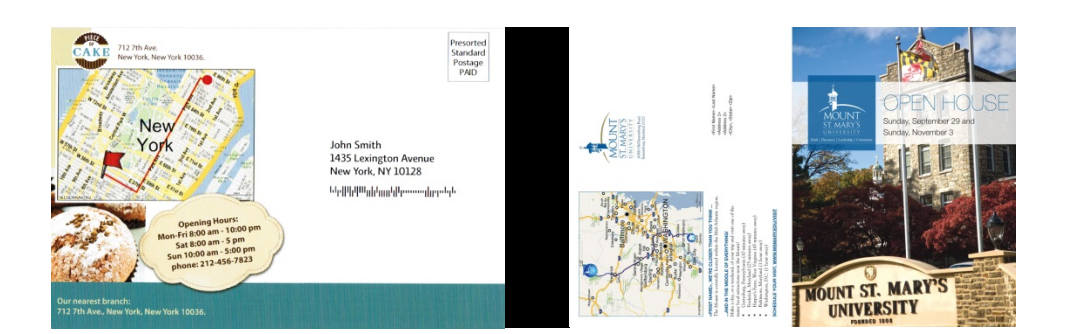
Figure 4. What it looks like in practice.

Map solutions from locr are provided as a service, so there are a variety of ways that service providers can add mapping and GEOservices to campaigns as a value added service. For example, XMPie users can use the self-service XMPie Mapping Service. It's as simple as buying credits, uploading data files, selecting map types and