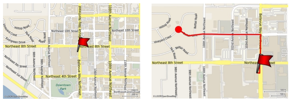
Figure 2: Personalized Maps with static location (left) and navigation map (right)

Campaigns that use maps to guide consumers to retail outlets and other services are not new, but the ability to select from different types of maps and to control the formatting and colors is new. Helping a consumer find their way to a product on the most efficient path saves time and creates a higher level of engagement. There are