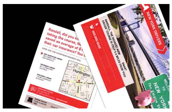
Figure 3. Show the way to the nearest location

Want to get more creative? A deeper dive into GEOservices can take you where the team at a National Non-profit has gone to help their members save money. They offer a Smart Driving Course, which allows those who complete it to pay less for their automobile insurance. Using GEOservices, they send an offer only to people who are within the state and close enough to the driving school locations for the offer to be valuable.