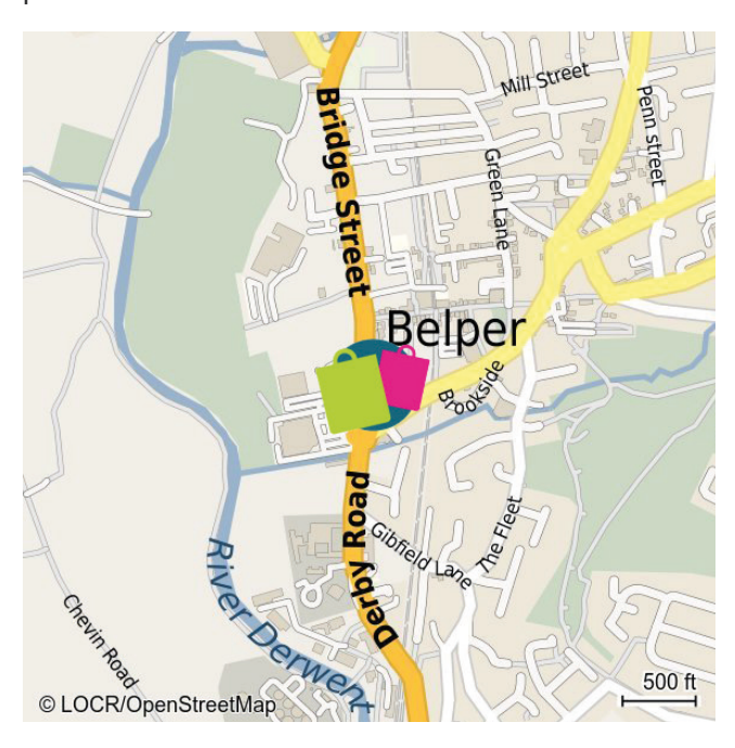
Example LOCALmap "Belper"

The response was 1% in the first week and sales increased by over 14% year on year. The A/B test revealed a 63% higher response rate for the direct mail with the personalized geomarketing components than for the static mailer without any personalization.