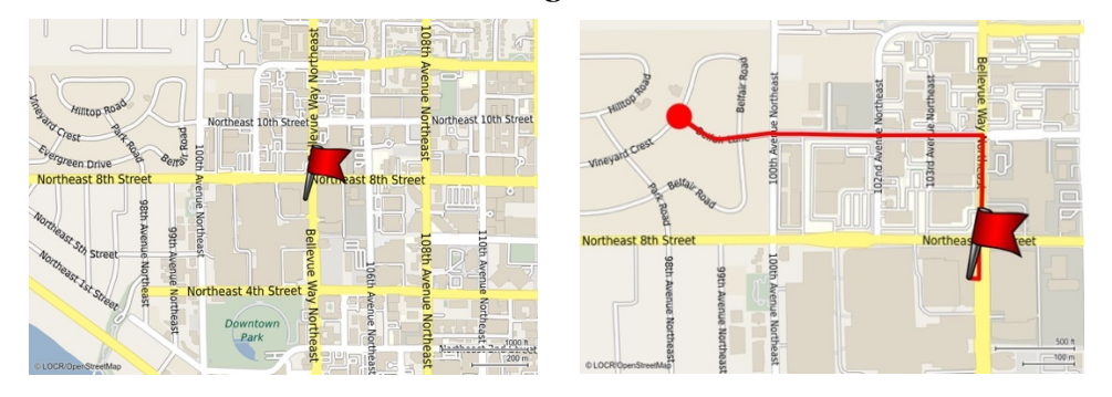
Figure 2: Personalized Maps with static location (left) and navigation map (right)

Campaigns that use maps to guide consumers to retail outlets and other services are not new, but the ability to select from different types of maps and to control the formatting